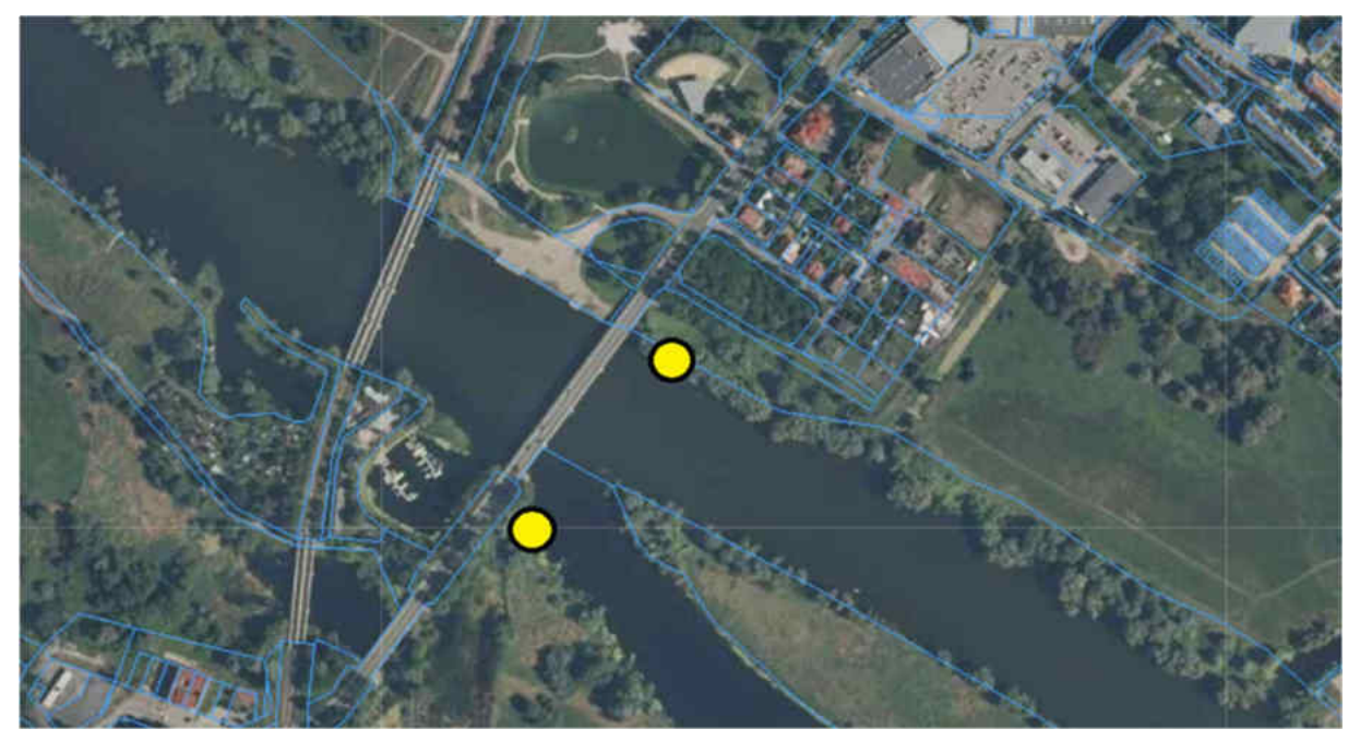
Fig. 4 Sampling places (yellow dot) in September 2018.

Contract 1B.5/2 - Reconstruction of the bridge to ensure minimum clearance - road bridge in km 2.45 of the Warta River in Kostrzyn nad Odrą