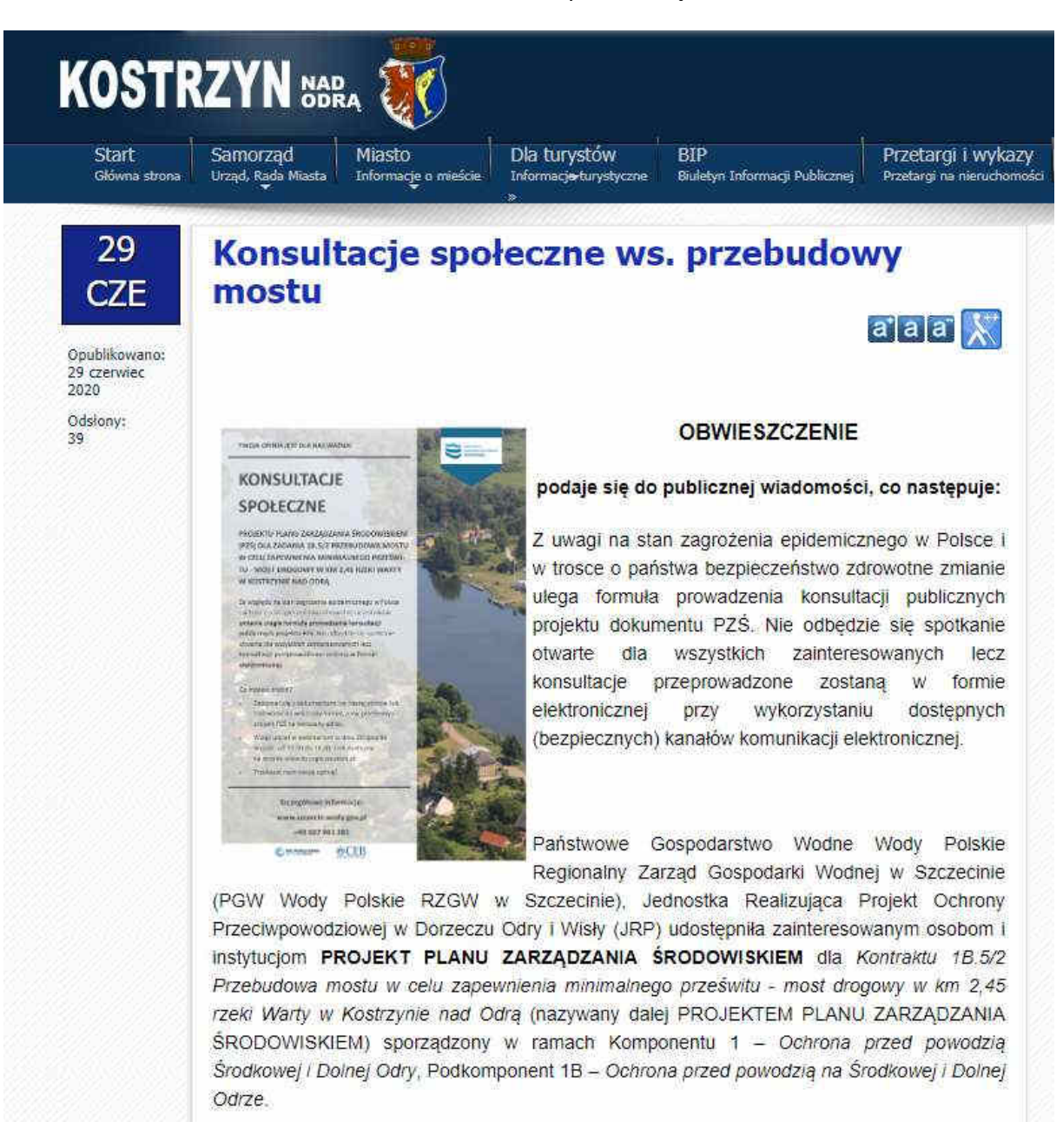
Fig. 8 Notice on the website of the Kostrzyn nad Odrą City Hall

Contract 1B.5/2 - Reconstruction of the bridge to ensure minimum clearance - road bridge in km 2.45 of the Warta River in Kostrzyn nad Odrą