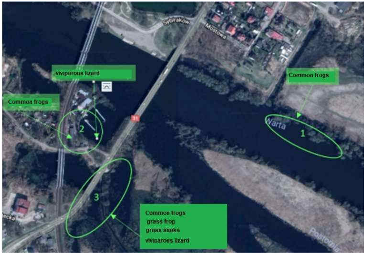
Fig. 5 Areas of occurrence of amphibians and reptiles in the area of the Task implementation.

The location of the areas described above where the occurrence of amphibians and reptiles was found is shown in the Figure below (Fig. 5).