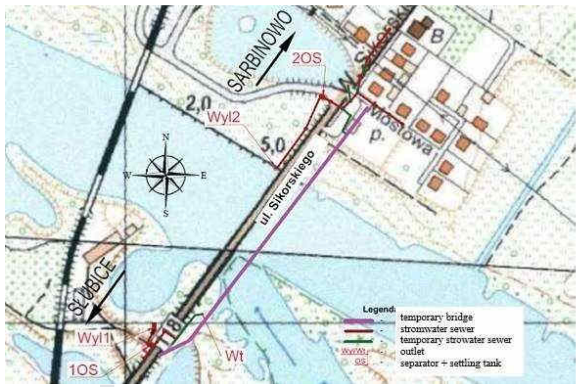
Fig. 1 Diagram of target and temporary stormwater drainage system

Before the outlets of the stormwater drainage system to the river, there have been designed systems of pre-treatment (separator integrated with the settling tank) enabling to pre-treat rainwater to the parameters required in the art. 17 of the Regulation of the Minister of Maritime Economy and Inland Navigation of 12.07.2019 on substances particularly harmful to the water environment and the conditions to be met at the discharge of sewage into waters or to the ground, as well as at the discharge of rainwater or snowmelt into waters or into water facilities.