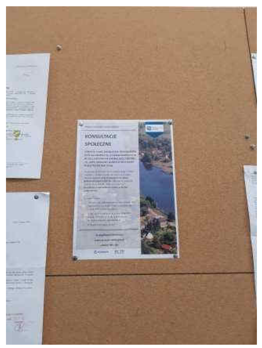
Fig. 13 Poster informing about public consultations, displayed on the notice board of the Kostrzyn nad Odrą City Hall

Contract 1B.5/2 - Reconstruction of the bridge to ensure minimum clearance - road bridge in km 2.45 of the Warta River in Kostrzyn nad Odrą