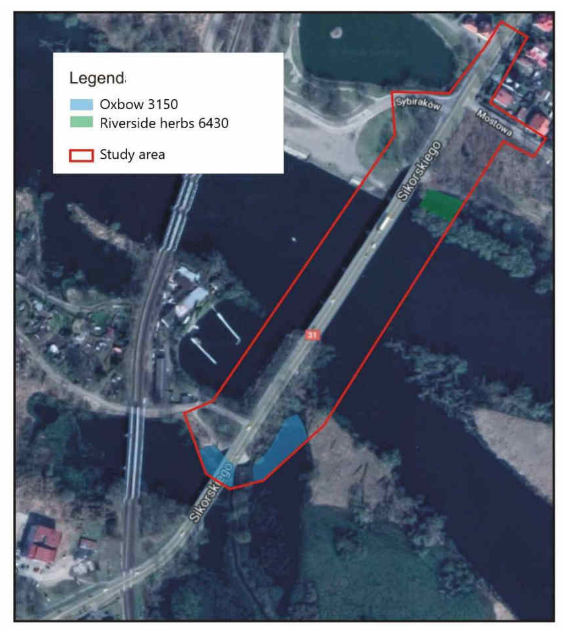
Fig. 3 Land cover in the Task implementation area.